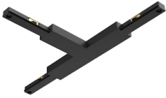
OPTIONAL Corner 06.2545.14 Zero Track Surface Profile. T-shaped connector