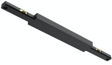
OPTIONAL 06.2541.14 Zero Track Surface Profile. Feed intermediate connector