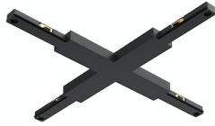
OPTIONAL Corner 06.2546.14 Zero Track Surface Profile. Cross-shaped connector