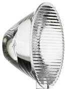
OPTIONAL Accessory Optical

08.8427.14 Screening external ring for Running Magnet spot module