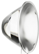
OPTIONAL Accessory Optical