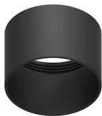
OPTIONAL Accessory Optical

08.8427.14 Screening external ring for Running Magnet spot module