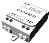
OPTIONAL Control interface Electrical

60.9683 Remote power supply. Dimmable through Casambi protocol. 24V. Dimming range 10-100%