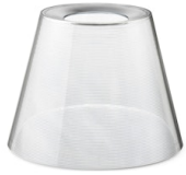
F6298000 Ktribe Floor 3 transparent diffuser assembly