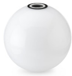
F3136030 IC Lights 1 diffuser for black version