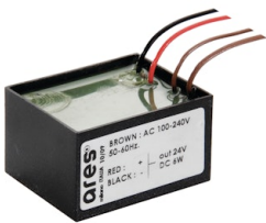
OPTIONAL Power supply

RF25750 Power supply 24Vdc 17W / 110-240V (15W@110V) IP20 Class II selv. Dimmable Push-Dimm Or 1.10V