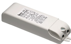
OPTIONAL Power supply

F990B28A000 Power supply 24Vdc 50W / 220- 240V IP67 Class I selv. Non Dimmable