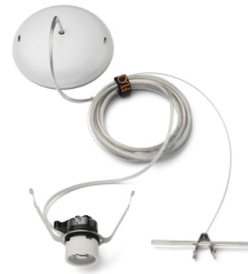
AU251200 GloBall Suspension 2 Halogen Electrical Wiring Assembly