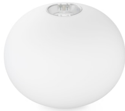
F3015061 Glo-Ball Suspension2 white diffuser