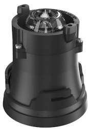
OPTIONAL Diffuser Optical

08.0956.14 3 Lens Kit for Emi Ceiling Large, Emi Floor & Emi Table - Flood Optic