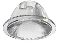
08.0717.00 Wide Flood Lens for Eclectic 90 Led Array