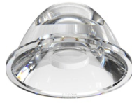
08.0720.00 Medium Lens for Eclectic 90 Power Led