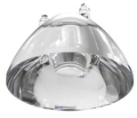
08.0718.00 Super Spot Lens for Eclectic 90 Power Led