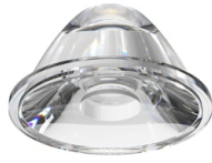
08.0719.00 Spot Lens for Eclectic 90 Power Led