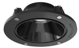
08.0741.00 Module Fix for Eclectic 90