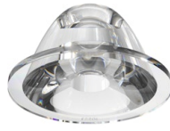
08.0716.00 Flood Lens for Eclectic 90 Led Array