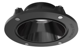
08.0741.00 Module Fix for Eclectic 90