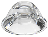
08.0715.00 Medium Lens for Eclectic 90 Led Array