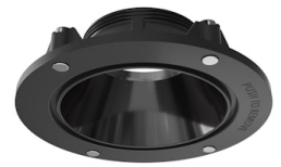
08.0741.00 Module Fix for Eclectic 90