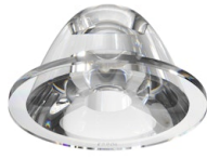
08.0716.00 Flood Lens for Eclectic 90 Led Array