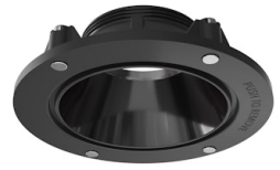
08.0741.00 Module Fix for Eclectic 90