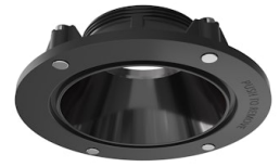
08.0741.00 Module Fix for Eclectic 90