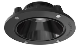
08.0741.00 Module Fix for Eclectic 90