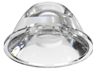
08.0715.00 Medium Lens for Eclectic 90 Led Array