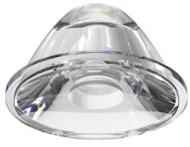
08.0714.00 Spot Lens for Eclectic 90 Led Array