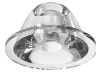
08.0716.00 Flood Lens for Eclectic 90 Led Array