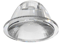
08.0717.00 Wide Flood Lens for Eclectic 90 Led Array