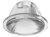
08.0717.00 Wide Flood Lens for Eclectic 90 Led Array