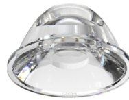
08.0720.00 Medium Lens for Eclectic 90 Power Led