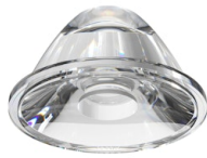
08.0719.00 Spot Lens for Eclectic 90 Power Led