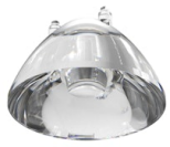
08.0718.00 Super Spot Lens for Eclectic 90 Power Led