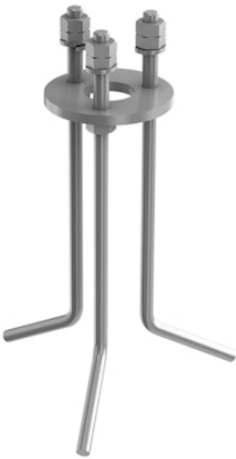
Plate with anchoring set for concrete floor installations

Are you a professional and your project needs consulting and support?