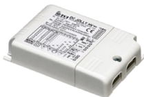
OPTIONAL Power supply

FA184 Power supply 16 x 1W/ 110÷240V - Iout 350mA (12x1W@110V) IP67 Class II Selv Dimmable Push-Dimm Or 1.10V