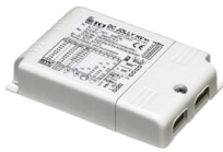
OPTIONAL Power supply

FA136 Ground Spike Aimer 1/Aimer 2/Aimer 3/Perseo 2