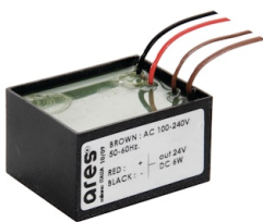
OPTIONAL Power supply

FA135 Power supply 13 x 2W/ 110÷240V - Iout 500mA (7x2W@110V) IP20 Class II Selv. Eq. Dimmable Push-Dimm Or 1.10V