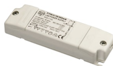
OPTIONAL Power supply

FA68 Power supply 10 x 1W/ 100÷265V - Iout 350mA (7x1W/110V) IP40 Class II Selv Eq.