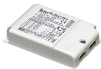
OPTIONAL Power supply

FA136 Ground Spike Aimer 1/Aimer 2/Aimer 3/Perseo 2