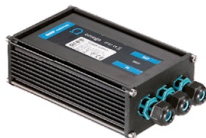
OPTIONAL Power supply

FA129 Power supply 16 x 1W/ 110÷240V - Iout 350mA (12x1W@110V) IP20 Class II Selv Eq. Dimmable Push-Dimm Or 1.10V