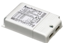
OPTIONAL Power supply

FA184 Power supply 16 x 1W/ 110÷240V - Iout 350mA (12x1W@110V) IP67 Class II Selv Dimmable Push-Dimm Or 1.10V