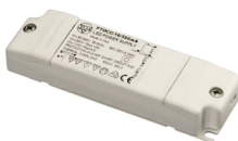
OPTIONAL Power supply

FA68 Power supply 10 x 1W/ 100÷265V - Iout 350mA (7x1W/110V) IP40 Class II Selv Eq.