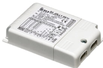
OPTIONAL Power supply

FA184 Power supply 16 x 1W/ 110÷240V - Iout 350mA (12x1W@110V) IP67 Class II Selv Dimmable Push-Dimm Or 1.10V