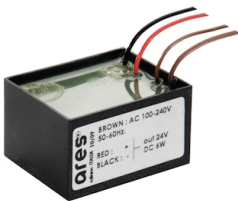
OPTIONAL Power supply

FA135 Power supply 13 x 2W/ 110÷240V - Iout 500mA (7x2W@110V) IP20 Class II Selv. Eq. Dimmable Push-Dimm Or 1.10V