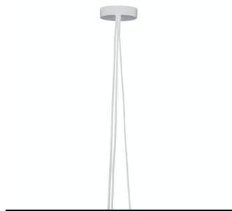
Aim Dimmer RF22227