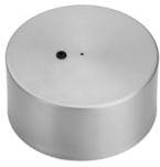
RF1873133 Coordinates S Assembly Big Rose Argent